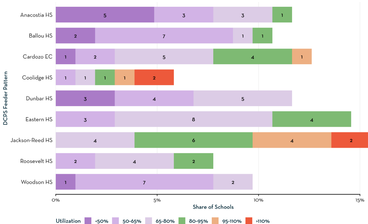
SY22-23 Utilization, Total Capacity

Note: Utilization reflects planned CIP programmatic capacity for schools currently being modernized. MacArthur HS is not included because it opened in SY23-24.